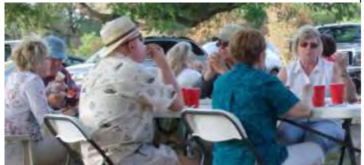
Tri-County Fish Fry